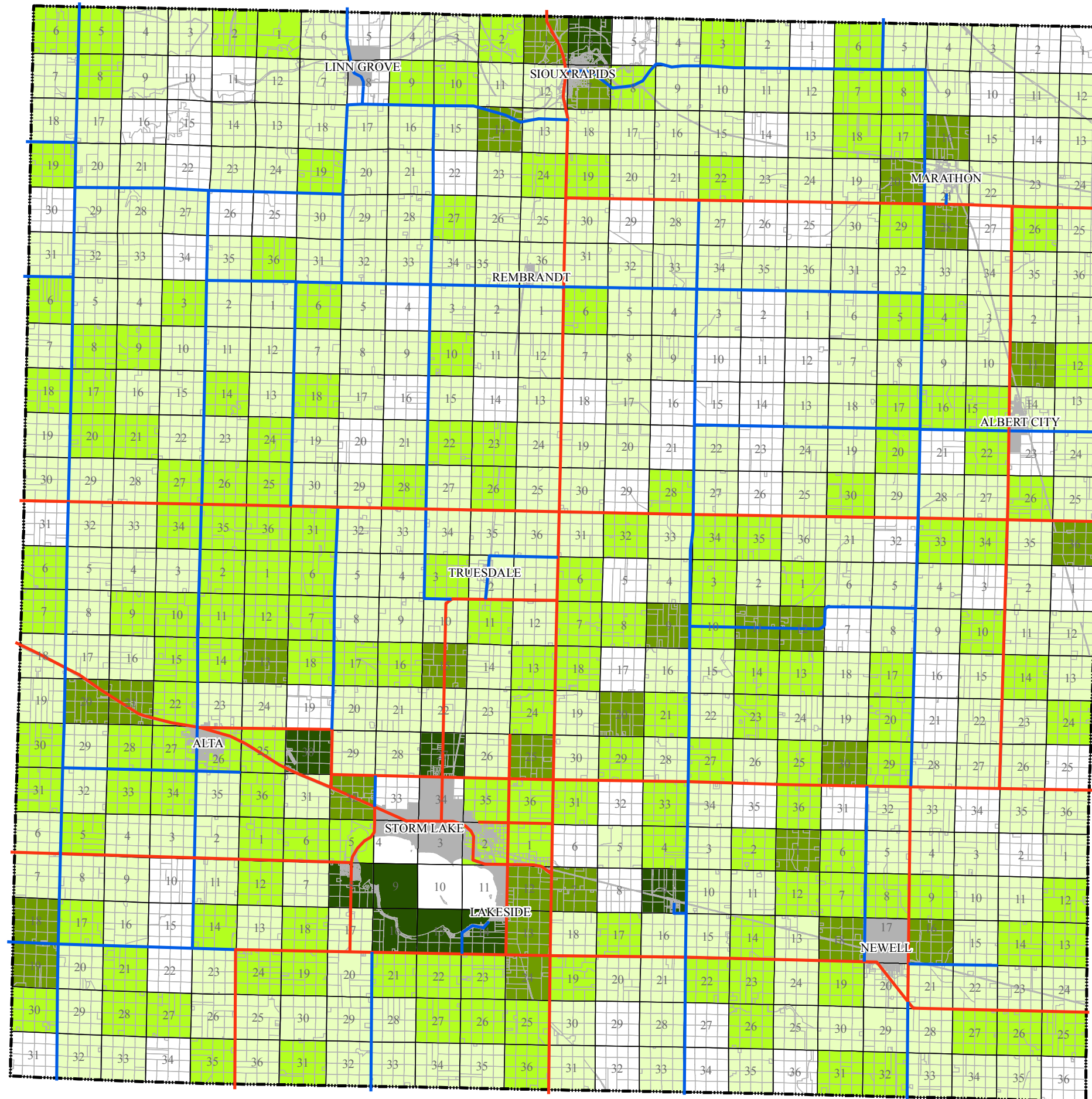
Figure 9: Total Residential Density Per Section