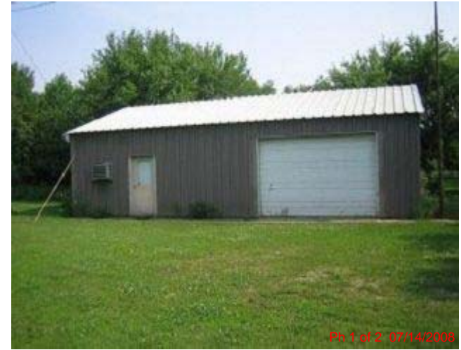
PH 1 of 2 07/14/2008

PIN 14-13-101-007 Deed FLANIGAN THOMAS J,SMITH DAVID L Section Deeded Acres 0.000 Contract Block Address 6214 120TH AVE Lot Map Area HAYES-RES Township Route Number 915-003-600 Plat Map Range Legal 13-90-37 STORM LAKE HAYES 3A IN NW NW W OF RR