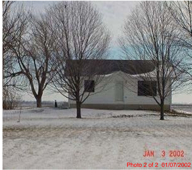
NEW MODULAR "STRATFORD" HOME