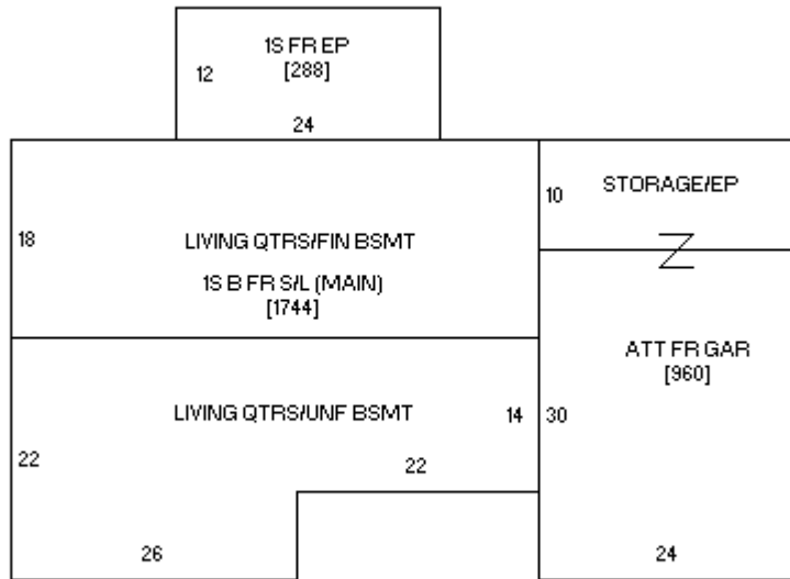
Sketch 1 of 1